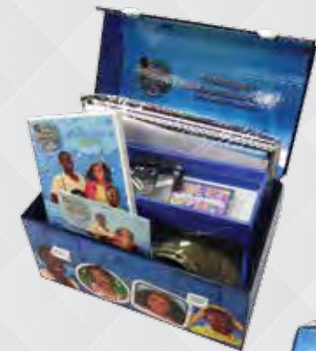
Collating, Kitting & Shrink Wrapping