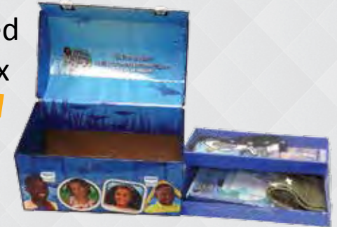
Custom Corrugated Tackle Box