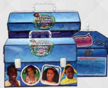
Bible Study Student Tackle Box