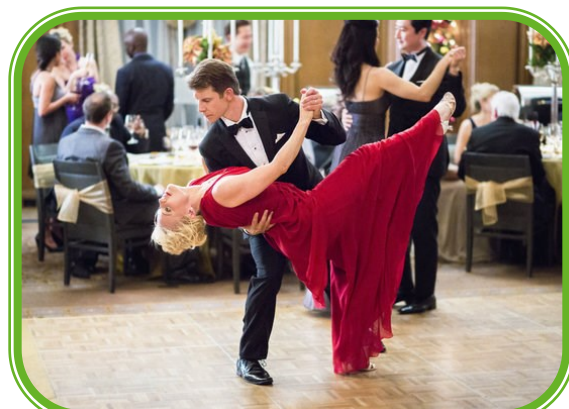
Signed, Sealed, Delivered For Christmas Hallmark Movies & Mysteries

Source: The Nielsen Company (11/22/14), Live+SD coverage ratings and impressions. *At the time of this publication.