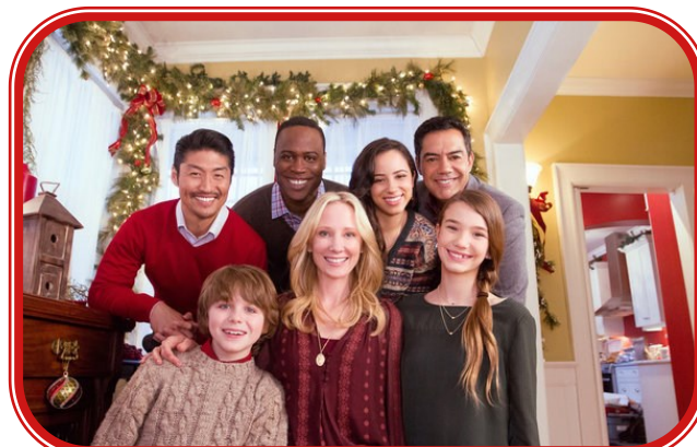
One Christmas Eve Hallmark Hall of Fame

Source: The Nielsen Company (11/15/14), Live + SD coverage rating and impressions.