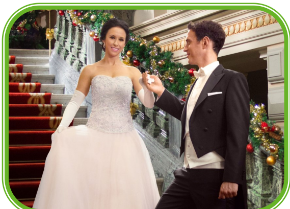
A Royal Christmas Hallmark Channel

A Royal Christmas , the sixth original premiere of 2014's Countdown to Christmas , premiered on November 22nd to a 4.0 household rating . It was seen by over six million unduplicated viewers, making it the 2nd largest unduplicated audience of any Hallmark Channel original movie in network history*. Additionally, A Royal Christmas elevated Hallmark Channel to be #1 ad-supported cable network of the day and week*.