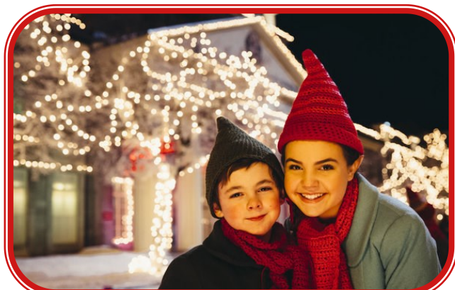
Northpole Premieres to Nearly 6 Million Viewers

Northpole premiered on November 15th as part of Hallmark Channel's Countdown to Christmas to a 3.5 household rating . It was seen by nearly six million unduplicated viewers. Through a collaboration with Hallmark Cards, products featured in the movie are available at Hallmark Gold Crown Stores and at www.hallmark.com .