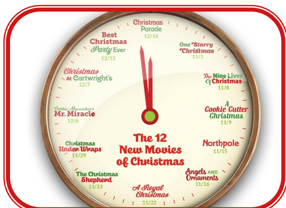
Countdown to Christmas Hallmark Channel