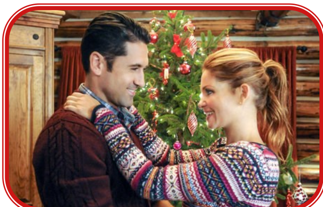
Christmas Under Wraps Hallmark Channel

Christmas Under Wraps , starring Candace Cameron Bure, premiered on November 29th as part of Hallmark Channel's Countdown to Christmas to a 5.0 household rating , reaching nearly 7.2 million unduplicated viewers, making it the highest rated and most watched Hallmark Channel original movie in network history.