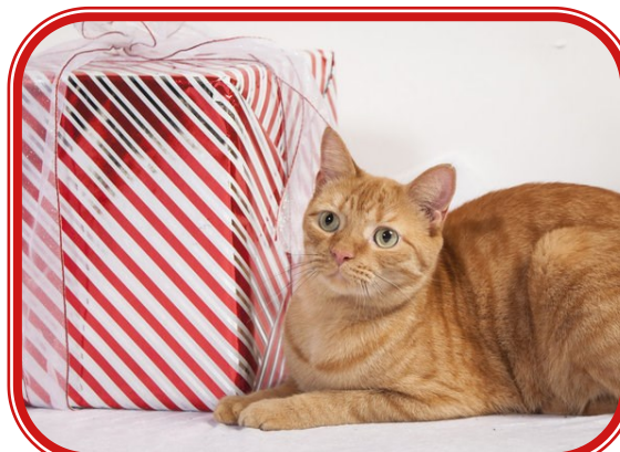
Happy The Cat Kitten Bowl

Source: The Nielsen Company (11/29/14), Live + SD coverage ratings and impressions.