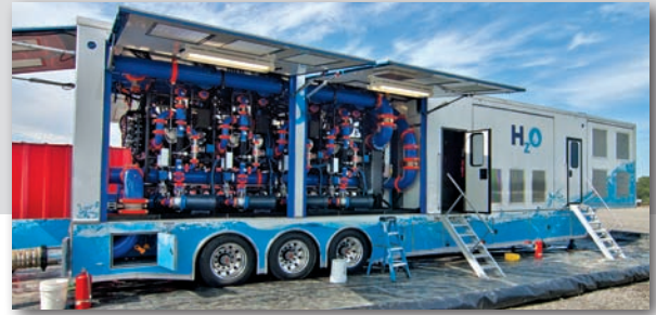
The Hydrozonix EF80 system treats up to 80 barrels per minute.