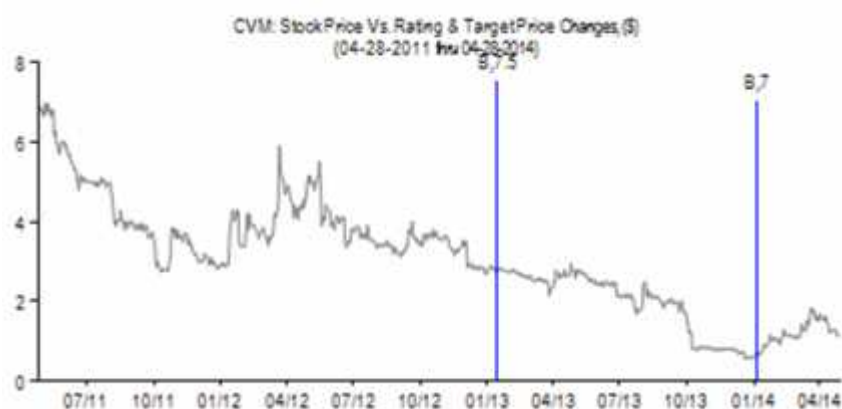
Rating and Price Target Change History